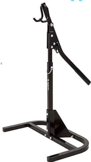
WARM-UP STAND (not a design drawing)